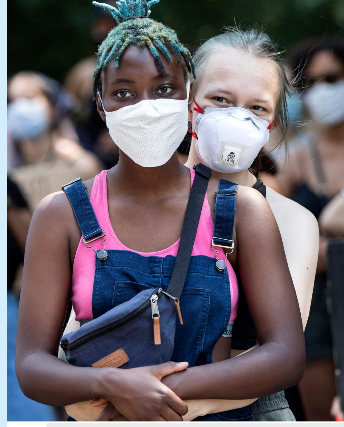
Black Lives Matter demonstration against racism in the Straße des 17. Juni in Berlin, 27 June 2020