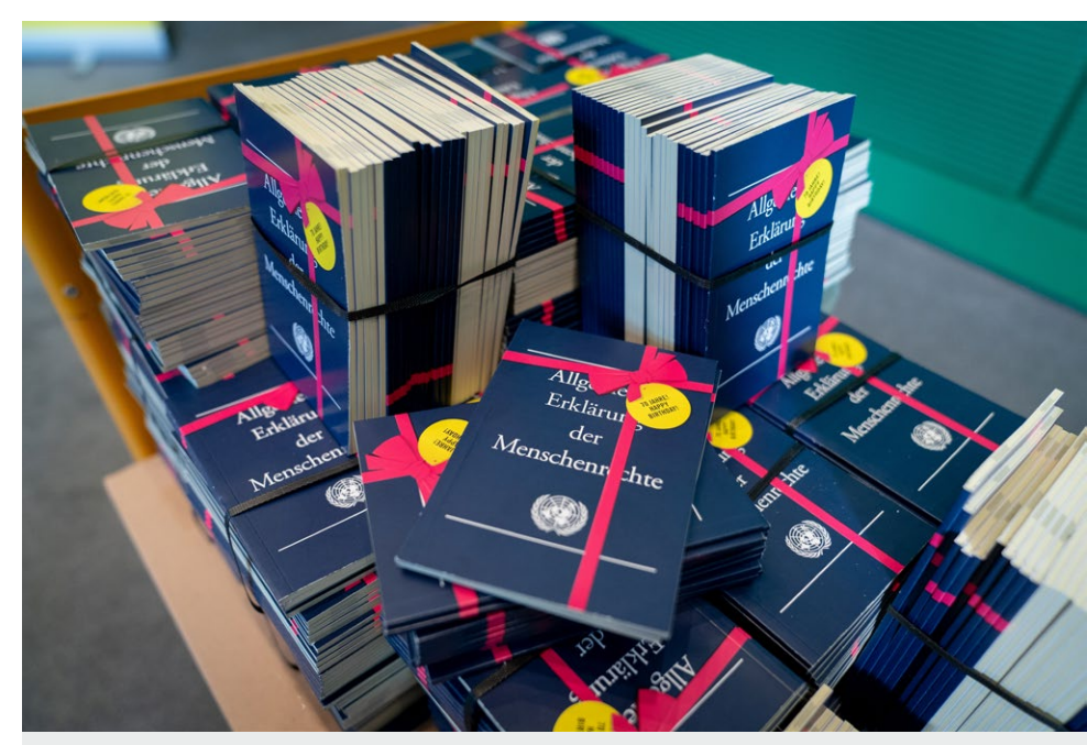
Copies of the Universal Declaration of Human Rights at an event in the Bundestag

The Action Plan sets out the priorities of the German Government's human rights policy from 2021 to 2022. It takes into account the observations and recommendations directed at Germany by various UN treaty organisations and the recommendations – those the German Government has accepted – made in the context of the UN Human Rights Council's Universal Periodic Review (UPR).