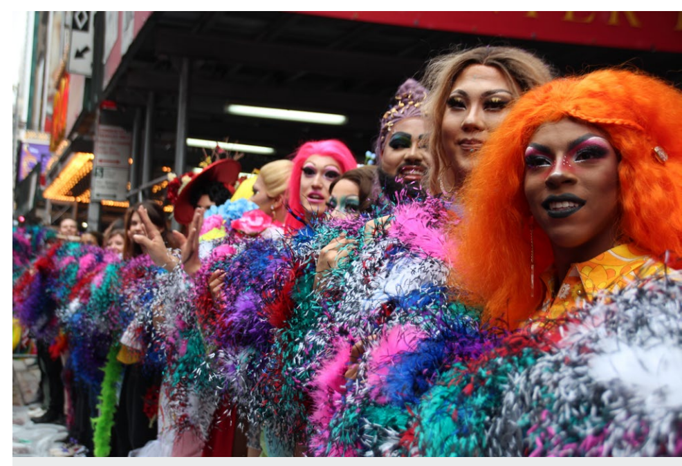
Drag queens unroll a rainbow-coloured feather boa in Times Square, New York, to mark the annual World Pride Festival.

Germany makes its voice heard globally against the criminalisation of homosexuality. Contrary to current international law, homosexuality remains a criminal offence in about 80 countries. In some countries, homosexual acts can even incur the death penalty. The 17<sup>th</sup> of May has been proclaimed as the International Day Against Homophobia, Biphobia, Intersexism and Transphobia, abbreviated to IDAHOBIT. Germany and many other countries use that day to draw attention to the issue, individually or jointly, through press releases and events.