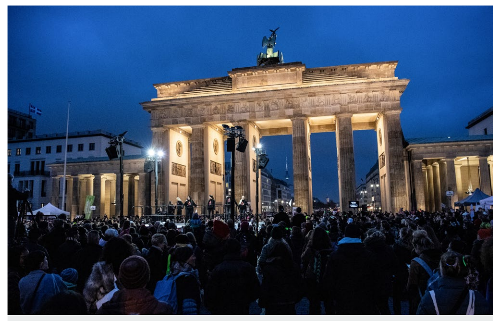
Dance demonstration highlighting violence against women organised by One Billion Rising Revolution