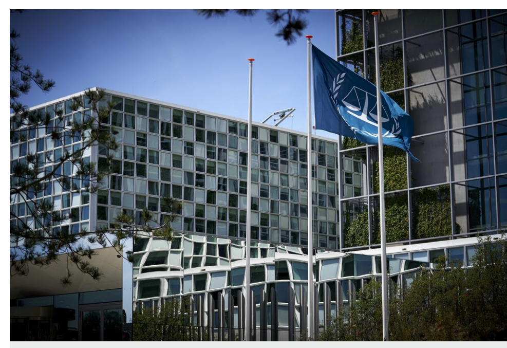
Exterior of the ICC in The Hague

Germany has a particular interest in supporting mechanisms of international justice, especially the system of criminal jurisdiction, the key element of which is the International Criminal Court (ICC) in The Hague. In 2019, Germany was the second-largest contributor to the ICC budget after Japan. The German Government vigorously campaigns for international acceptance of the Rome Statute and of the ICC and is a particularly active participant in the current reform debate.