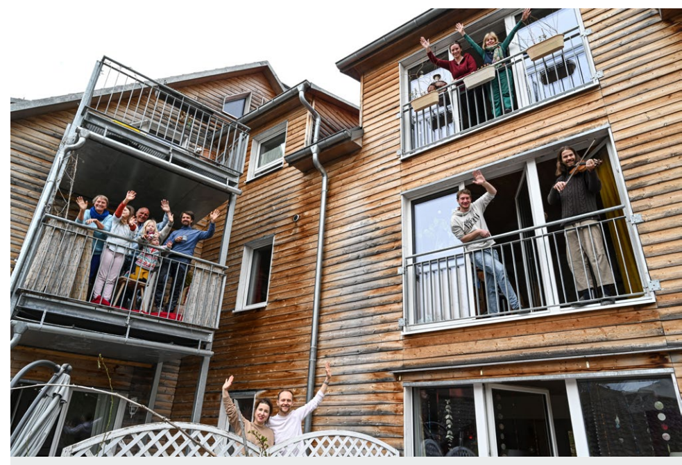
LebensWert, a multigenerational home in Bavaria