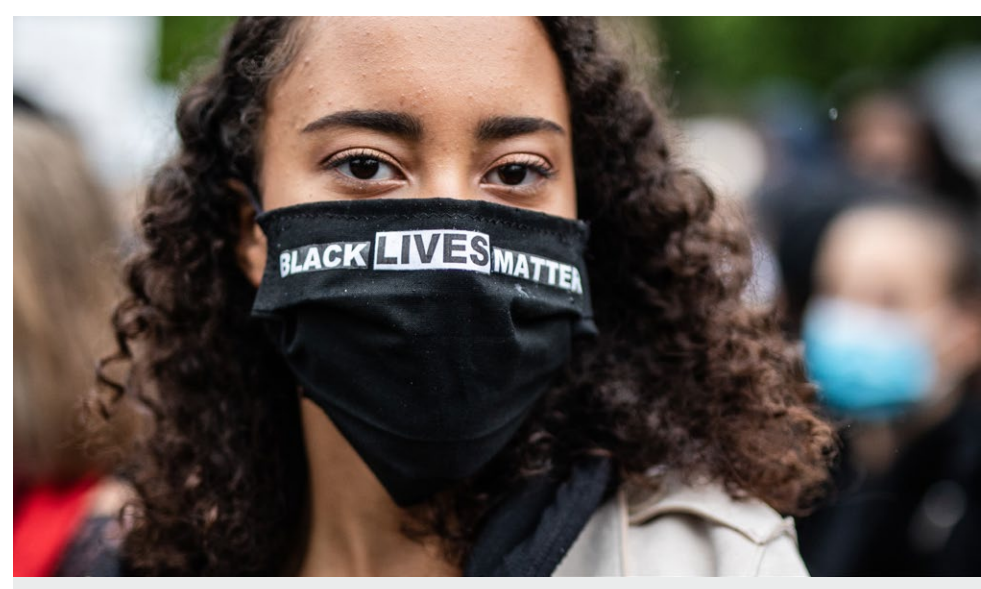
Participant in a silent demonstration in Stuttgart against racism and police violence