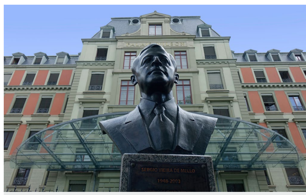
The Palais Wilson in Geneva houses the office of the UN High Commissioner for Human Rights.