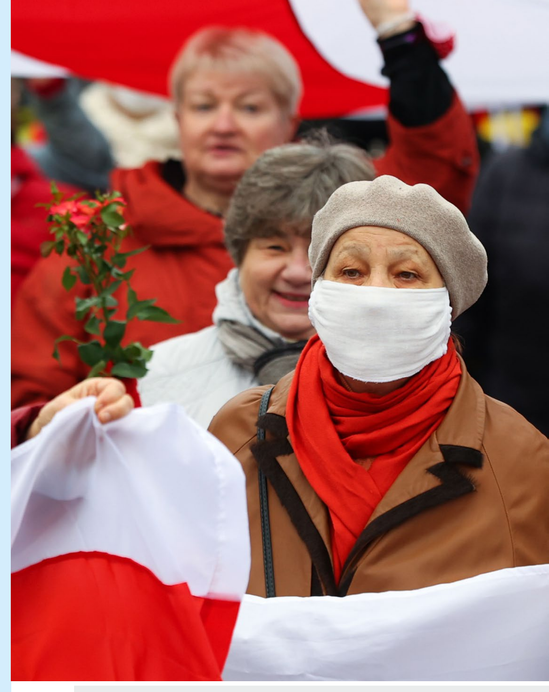
Minsk, Belarus – 2 November 2020