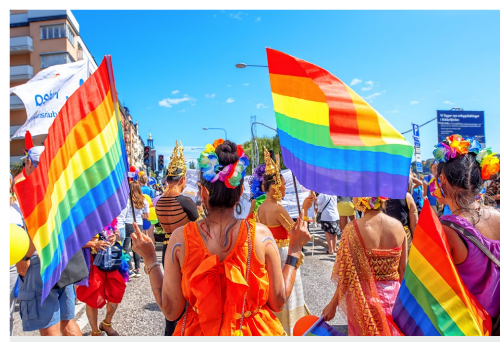
Pride Parade in Stockholm, August 2019