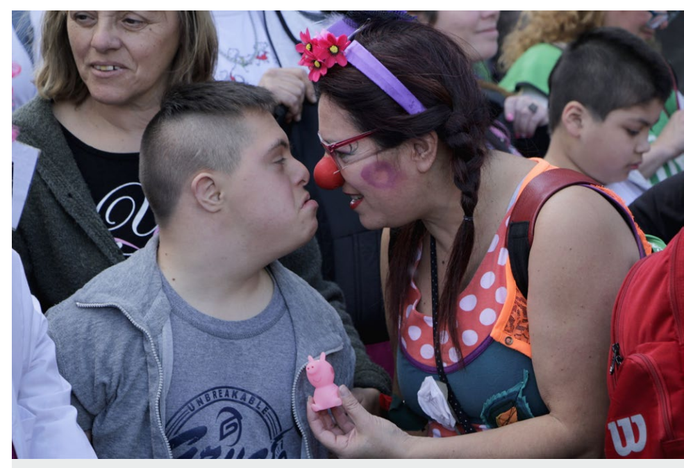
Demonstration in Buenos Aires, Argentina, in October 2018 against the reduction in state aid for people with disabilities

the Rights of Persons with Disabilities and of the 2030 Agenda with its guiding principle "Leave no one behind". The latter has defined inclusion as a key element of social development processes and contains binding requirements to make development projects inclusive. Also firmly anchored in this approach is the active involvement of experts with disabilities in the implementation of measures, in accordance with the principle "Nothing about us without us".