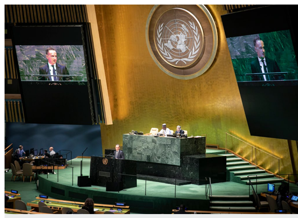
Speech by Federal Foreign Minister Heiko Maas (SPD) at the 68th session of the UN General Assembly in New York on 25 September 2019.