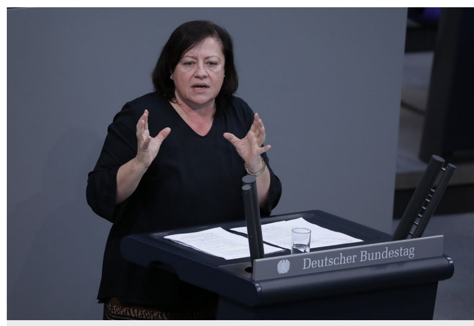
Bärbel Kofler (SPD) Federal Government Human Rights Commissioner speaking in the Bundestag on the Strong Families Act.

The German Government has further developed its anti-poverty policy in recent years by fostering employment opportunities in conjunction with supplementary social-security payments. In view of their heightened risk of poverty, the focus here is on families with children, especially single-parent families.