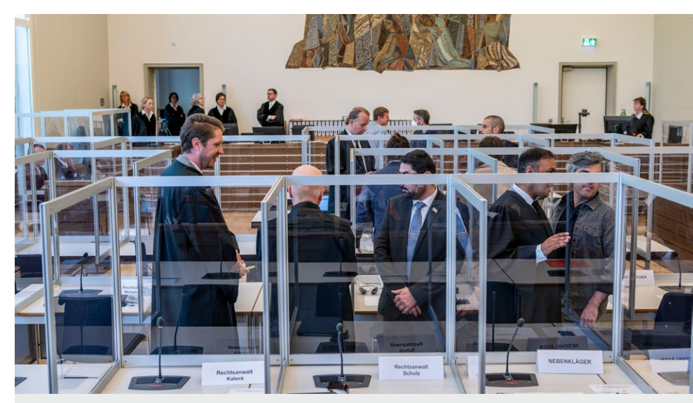
Tackling impunity: alleged members of the Syrian regime are being tried for crimes against humanity in a German court in Koblenz.

In the Council of Europe , working to protect human rights defenders and to prevent and eradicate impunity for perpetrators of serious human rights violations remain priorities. One of the foundations for these efforts is the Guidelines for eradicating impunity for serious human rights violations, which were adopted by the Committee of Ministers in 2011. The Guidelines urge states to fight impunity as a matter of justice for the victims, as a deterrent to prevent fresh violations, and to uphold the rule of law and public trust in the justice system. The Council of Europe Commissioner for Human Rights is also deeply committed to these goals.