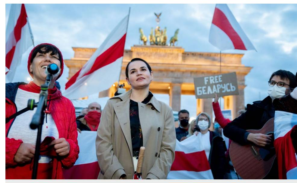
Belarusian opposition politician Svetlana Tikhanovskaya in Berlin

Belarus exhibits considerable shortfalls in civil and political rights, particularly with regard to freedom of the media, assembly and association. Human rights NGOs and independent parties, associations and media companies are subject to massive restrictions. The human rights situation in Belarus has continuously deteriorated since December 2019. After wholesale repression in the run-up to the presidential elections on 9 August 2020, it reached its lowest point to date with the violent response to the peaceful protests which followed the election. Opposition politicians, human rights defenders, independent journalists and participants in the protest movement have been subject to major reprisals including threats, persecution, arrests, expulsions and mistreatment, in a number of cases, of the worst kind.