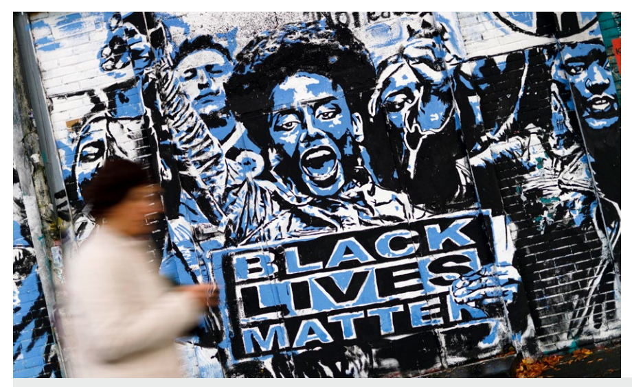
Mural in Cologne, October 2020