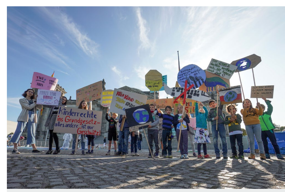
Children holding up banners with their demands in front of the Bundestag to mark Universal Children's Day, 20 September 2020