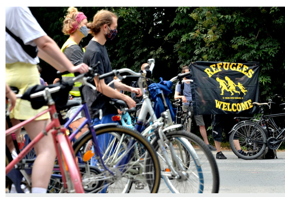
Bike demonstration in Oldenburg, Lower Saxony, to highlight the living conditions in a refugee shelter