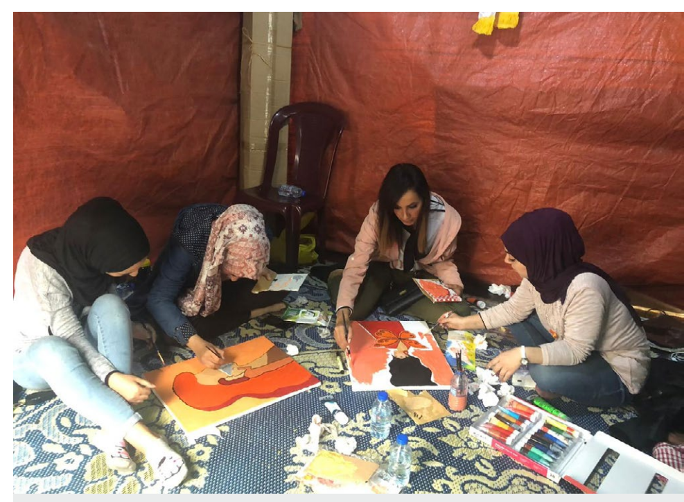
Preparations for the celebration of 16 Days of Activism against Gender Violence Project of SAWA Organization for Human Rights

Human rights violations occur in the justice system too, including arbitrary arrests and torture. Death sentences are carried out. Due to the difficult security and supply situations, circumstances remain fraught for the internally displaced who have fled Islamic State.