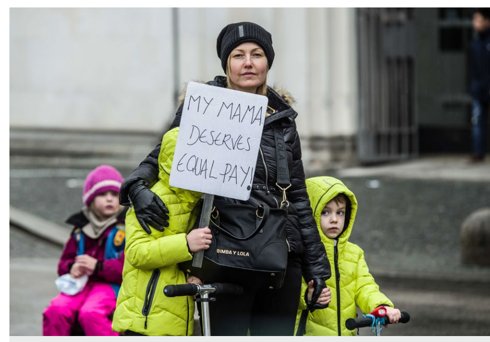
Women's March 2020, Munich

At the same time, the German Government is working to break down vertical segregation on the labour market. The already successful Act on the Equal Participation of Women and Men in Executive Positions in the Private Sector and Public Service is being made more effective during the current legislative term on the basis of the Coalition Agreement. This corresponds with the recommendations of the UN Committee on Economic, Social and Cultural Rights (UPR recommendation 38) as regards increasing the proportion of management positions held by women. In execution of the Coalition Agreement between the CDU, CSU and SPD for the 2018-2021 legislative term, the governmental bill for a second Executive Positions Act is to be passed by the German Bundestag before the end of the term.