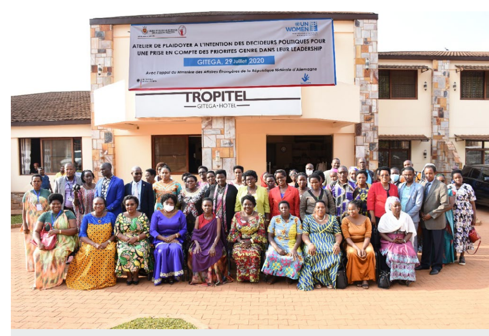
In a workshop for newly elected political decision-makers from the parliament and senate, UN Women and Burundi's National Women's Forum raise awareness of gender issues as a governance priority, July 2020.