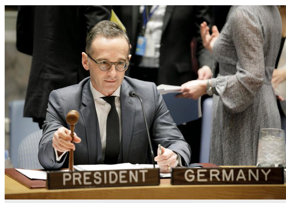
Foreign Minister Heiko Maas (SPD) travels to New York on 2 April 2019 for the start of Germany's Presidency of the UN Security Council.