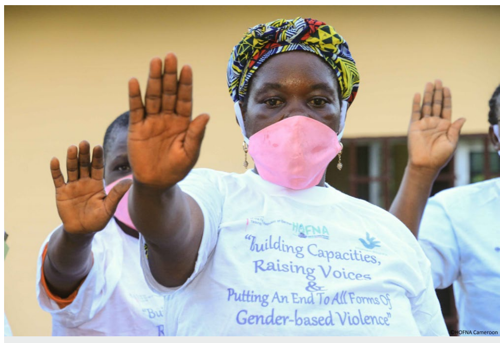
The Cameroonian NGO HOFNA is tackling violence against women and girls, as well as its causes. The Federal Foreign Office regularly provides funding for the organisation's projects.