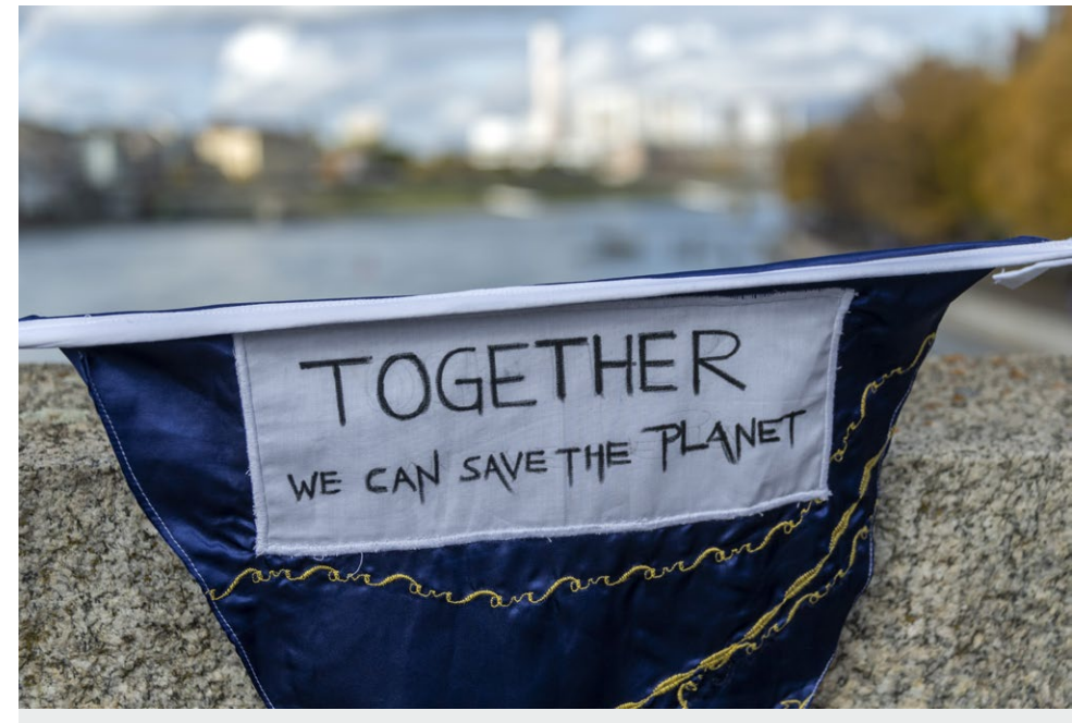
Bunting at a climate rally in Switzerland in October 2020

> People in developing countries, such as small-scale farmers, are particularly affected by climate change. The German Government will support climate risk assessments for countries in sub-Saharan Africa. Adaptation strategies selected on this basis in collaboration with local stakeholders and with a focus on water availability and resilient agriculture serve to ensure the German Government's development policy portfolio is climate-secure.