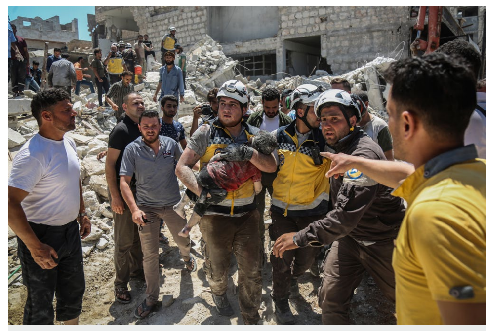
White Helmets humanitarian workers free an injured child from the rubble of a house (July 2019).

The armed conflict in Syria continued unabated throughout the reference period. The UN estimates that 6.2 million people are internally displaced, while some 5.6 million Syrians have fled abroad. Fighting has lately reduced in the last rebel stronghold, Idlib, since the ceasefire agreement between Turkey and Russia was signed in March 2020. Nonetheless, the situation remains disastrous overall for human rights and international humanitarian law.