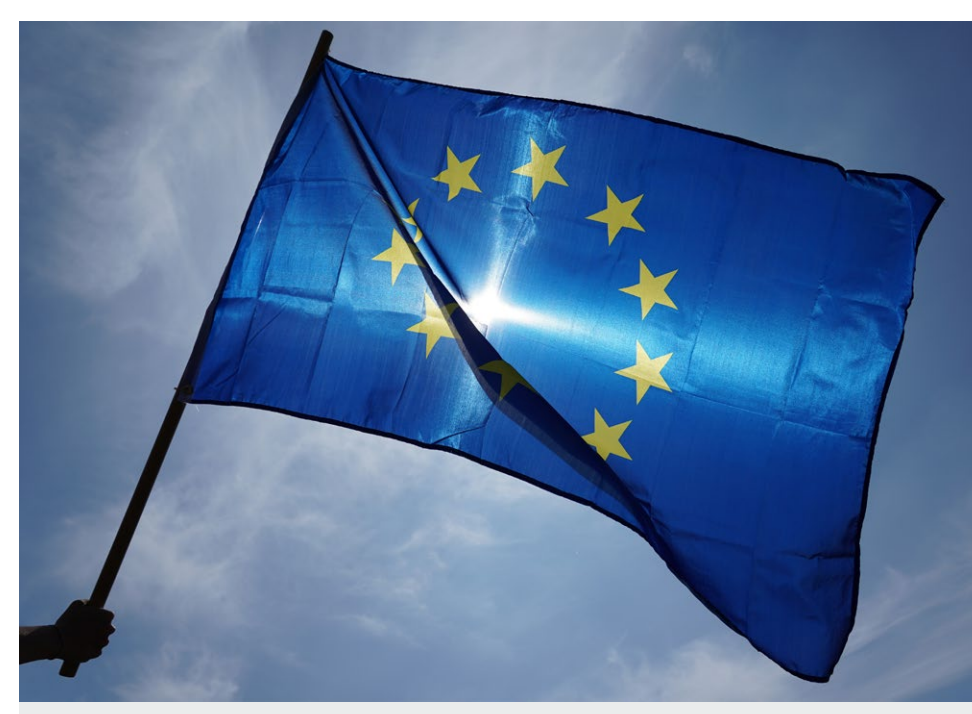
EU flag at a demonstration for Europe, May 2019