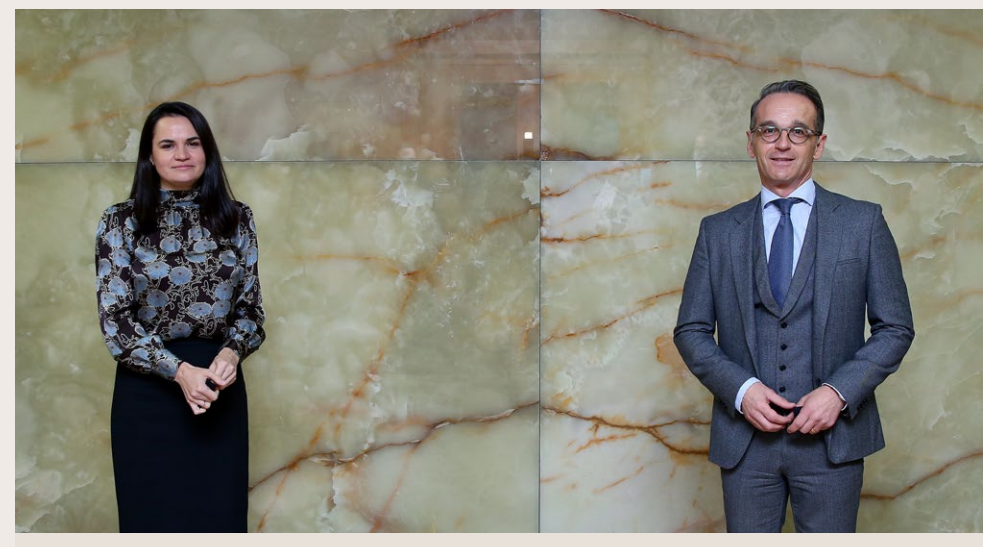
Federal Minister for Foreign Affairs Heiko Maas meets Svetlana Tikhanovskaya, an unaffiliated civil rights activist and candidate for the presidential elections in Belarus in 2020, for talks at the Federal Foreign Office in Berlin on 7 October 2020 © photothek.